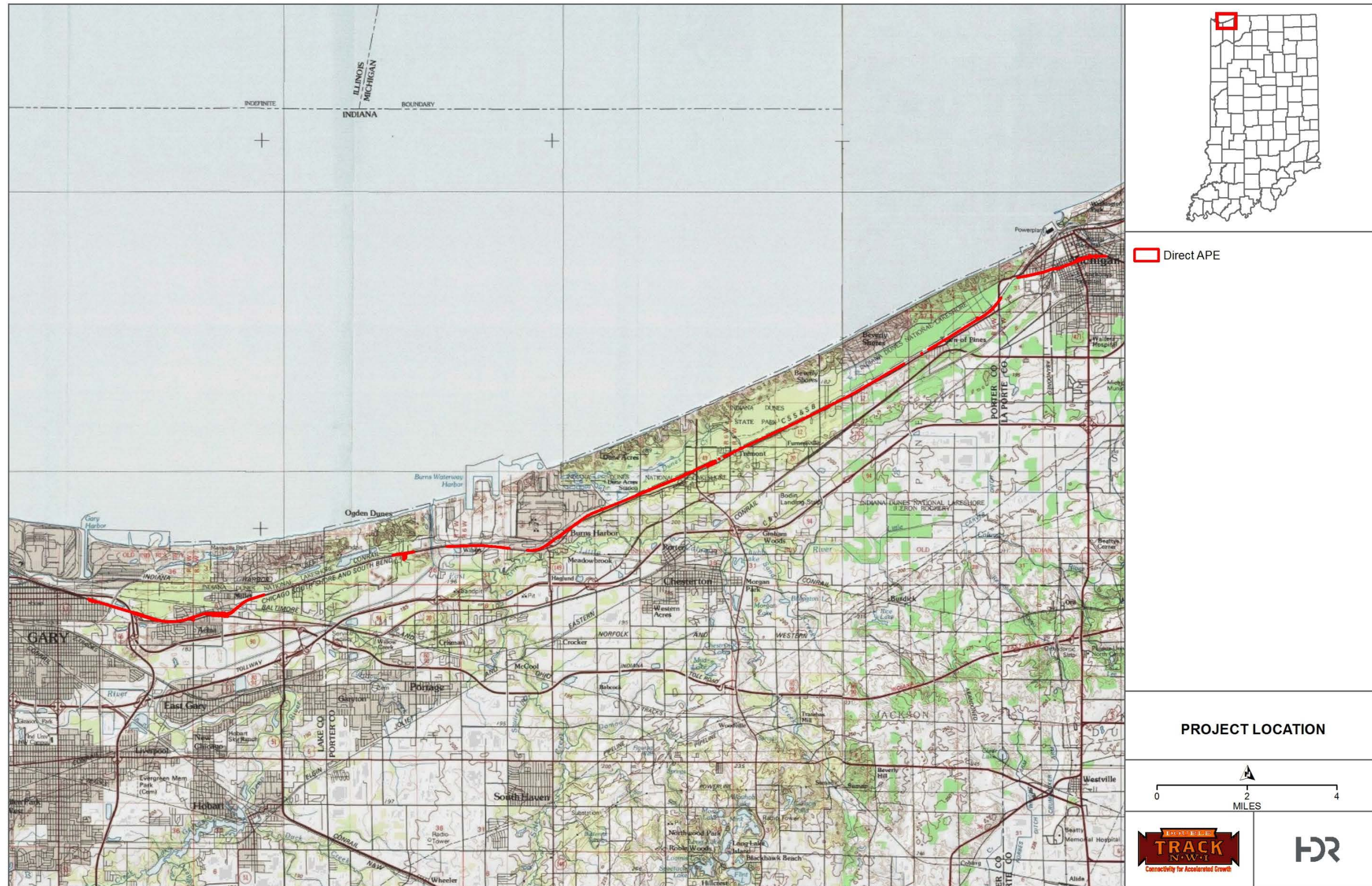
Figure 2. USGS topographic map with the Project location indicated.